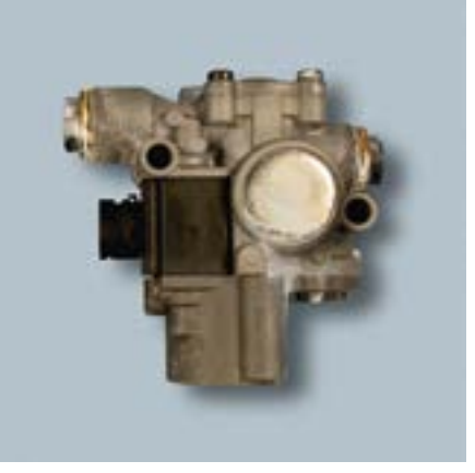
WABCO outperforms in 10 day salt spray test.