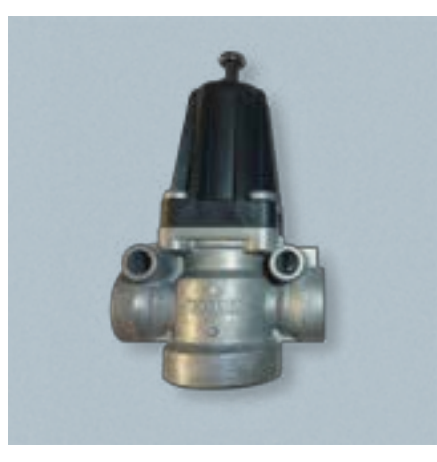
WABCO outperforms in overload test.

Tempted to keep costs down by replacing genuine WABCO parts with lower cost copies? Beware! Your business could end up paying a high price.