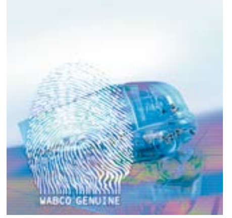
A genuine WABCO part is as unique as your fingerprint. Accept no substitute.